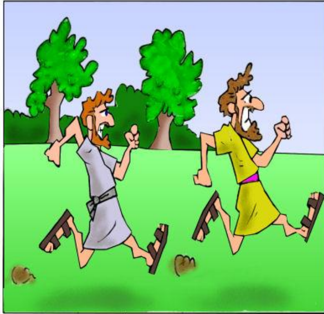
The First Annual Empty Tomb Dash and John defeats Peter John 20:1-4