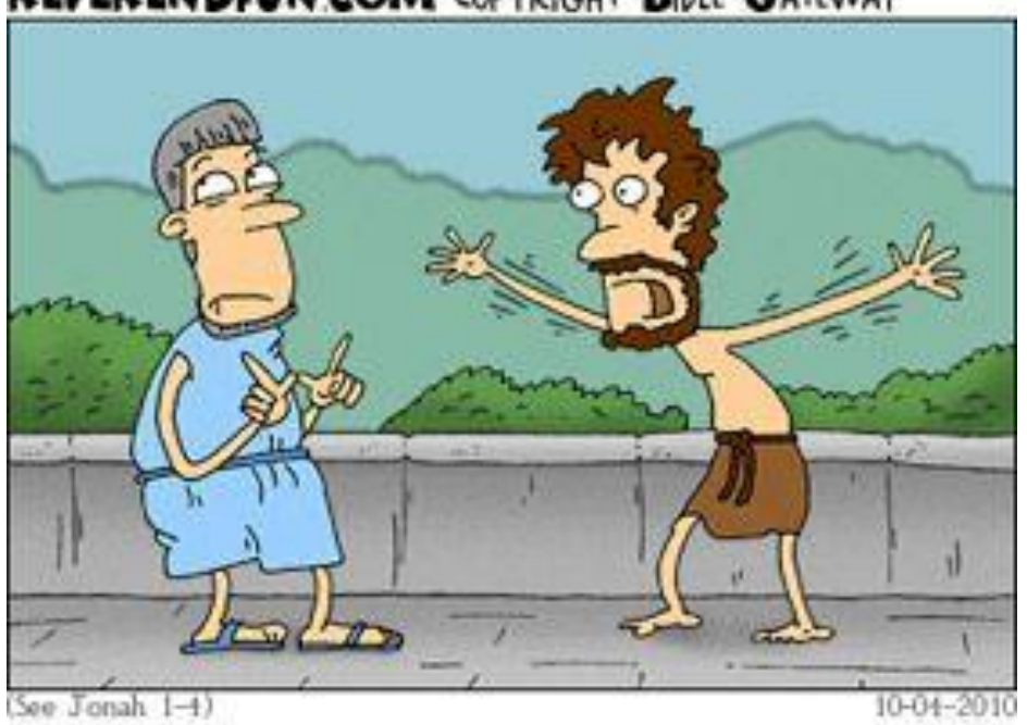
JONAH ATTEMPTS TO SHARE HIS TALE WITH DOUBTING THOMAS