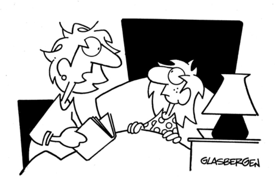
"Yes, the disciples followed Jesus... but not on Twitter."